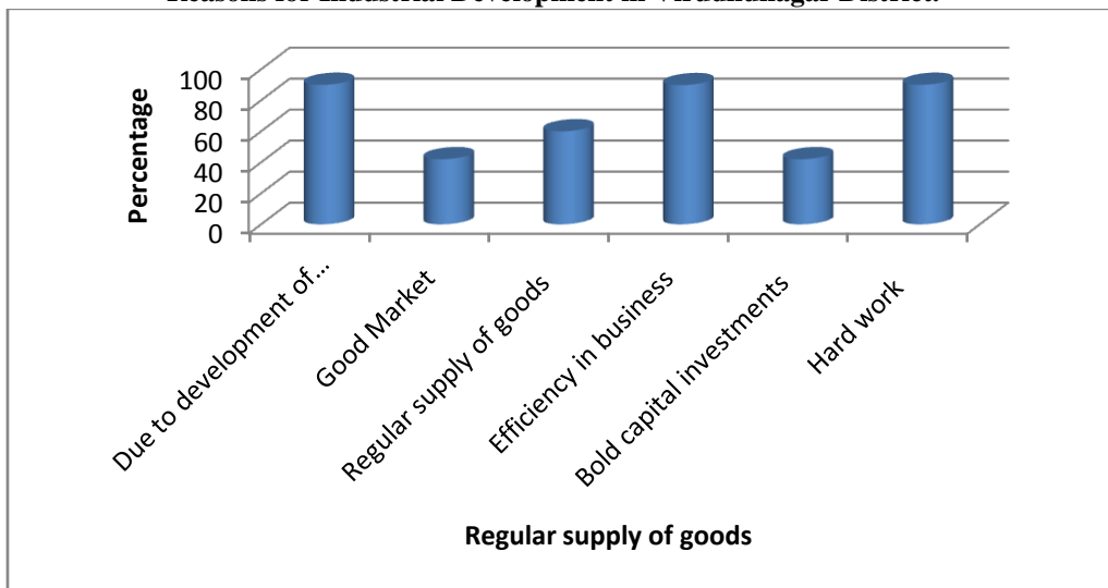
Reasons for Industrial Development in Virudhunagar District. 18

Last but not least, the industry must withstand during its harder times. Once an industry is set on to roll, there could be so many hurdles industrialists have to overcome. Some of them had even withdrawn from the business considering those hurdles as a block due to the lack of the right guidance/support while others had successfully challenged it, continued and improved its progress by considering those hurdles as stepping stones. Among them, 93% of the people in the sample favourably replied that they would continue their business with a positive attitude to making up the losses as a result of price fluctuations in due course. They knew that it is normal to have ups and downs in business.